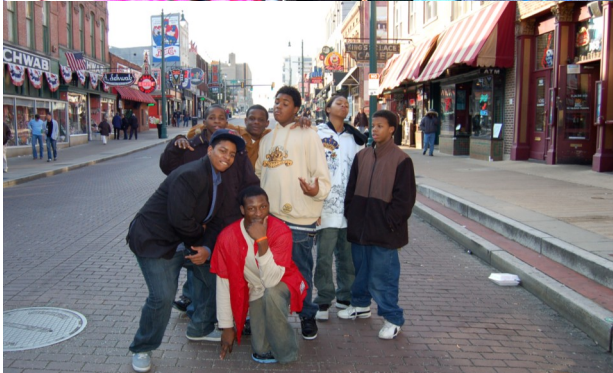
Below: Visiting the Civil Rights Museum and the Lorraine Motel where Martin Luther King Jr. was assassinated.